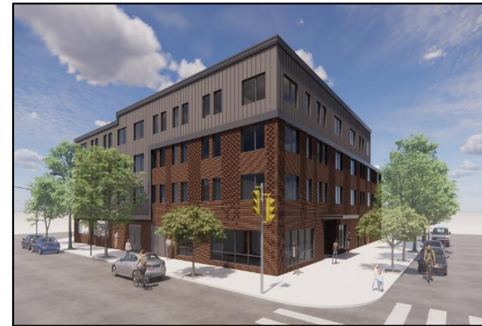
2800 Diamond Senior Apartments*