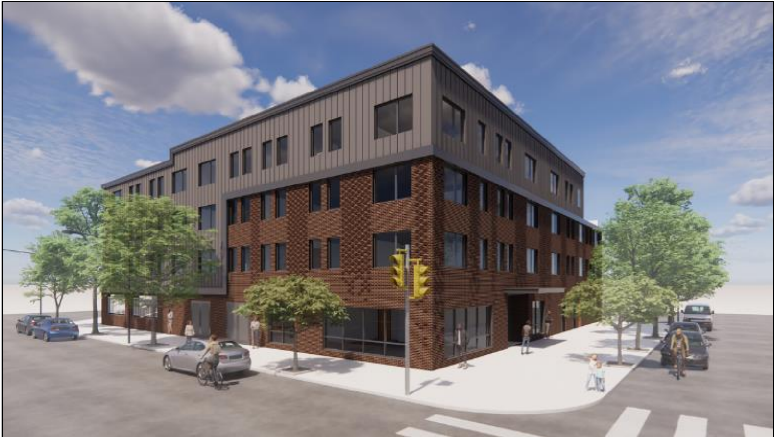
Exterior Rendering – 2800 Diamond Senior Apartments

Design Pending Finalization – Materials, Window Layouts & Color Palette Subject to Change