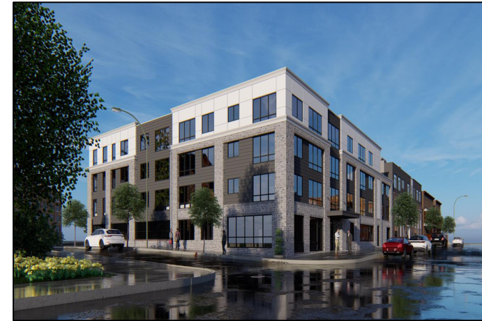
2800 Diamond Multifamily Apartments