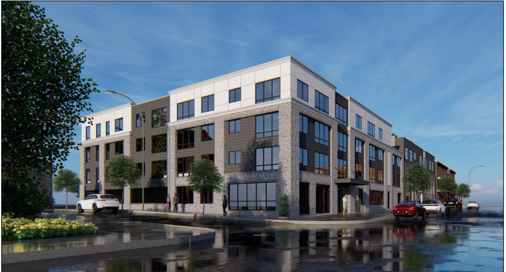
Exterior Rendering – 2800 Diamond Section 8 Housing

Strawberry Mansion Neighborhood – 2800 Diamond Street